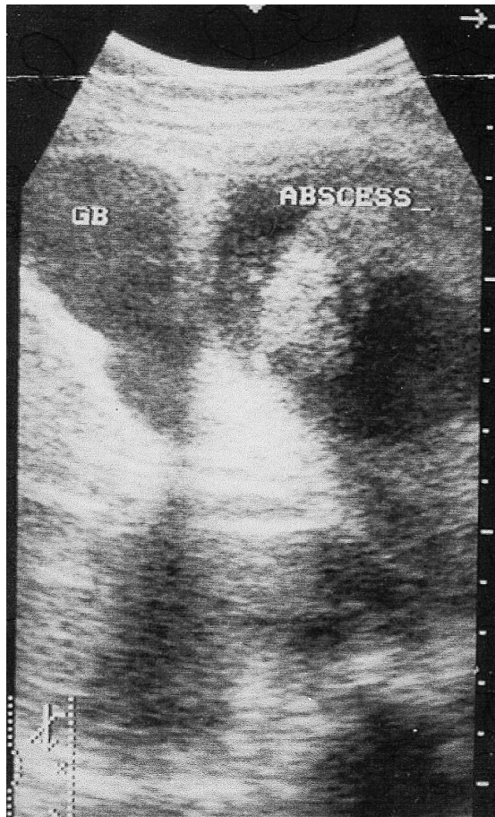
Fig. 1 Ultrasonography showed wall thickening of the gallbladder and abscess formation adjacent to the gallbladder.

of infection of the umbilicus. At this point the white blood cell count was 3,300/\mu\text{l} and CRP was 1.9\text{mg/dl} . Though the patient did not show severe symptoms, surgical treatment was performed because the abscess did not dwindle with conservative treatment.