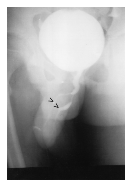
Fig. I Voiding cystourethrography shows complete urethral duplication.

Proximal), Type II-Complete urethral duplication (A. 2 meati / B. 1 meatus), Type III-Urethral duplication as a component of partial or complete caudal duplication. Das and Brosman [3] classified duplicated urethra into 3 types. Type I is a complete accessory urethra arising from a separate or confluent opening within the bladder and extending to an external orifice. Type II includes accessory urethras that arise from the primary urethra and may or may not extend to a distal orifice. Type III arises from the bladder neck or prostatic urethra and opens onto the perineum. The main urethra may be atretic. Firlit [7] classified duplication as a urethra that arises proximally from the bladder, bladder neck or duplicated bladder. Its distal course usually is dorsal to the main urethra. The complete form extends from the bladder to the glans.